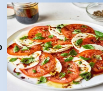
Tomato And Mozzarella Salad